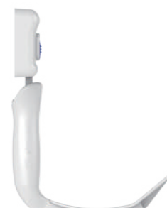
UED-F4 adult, obesity