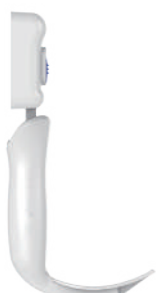
UED-F1 0-2 yrs