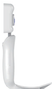
UED-MF2 2-6 yrs