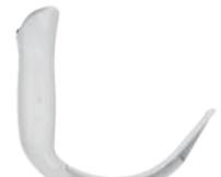
UED-D5 difficult type