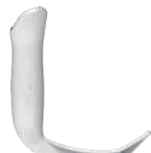
UED-D2 2-6 yrs