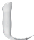
UED-D1 0-2 yrs