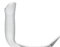
UED-D4 adult, obesity