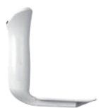
UED-MD1 Miller 1